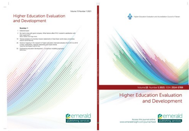
HEED Volume 15 Issue 1

Please visit: https://www.emerald.com/insight/publication/issn/2514-5789/vol/15/iss/1