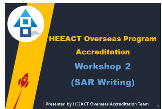
HEEACT Overseas Program Accreditation Workshops